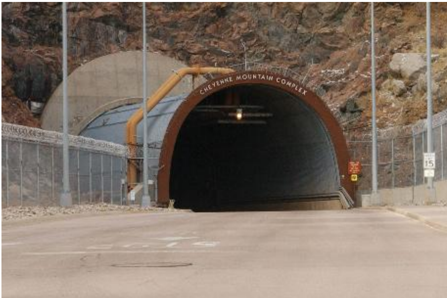
North portal, Cheyenne Mountain

"Not only is our government focused on building deep secret cities, but so are Illuminati families."