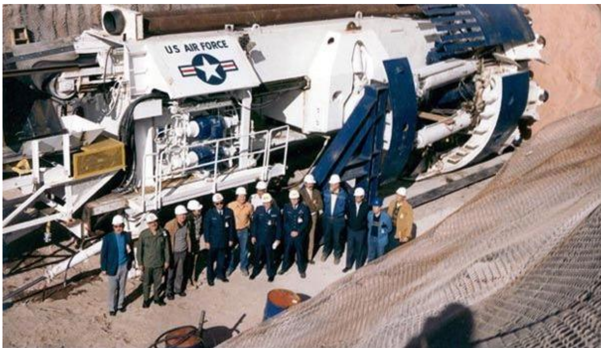
Photo of United States Air Force tunnel boring machine at Little Skull Mountain, Nevada, USA, December 1982. There are many rumors of secret military tunnels in the United States. If the rumors are true, machines such as the one shown here are used to make the tunnels.

The beautiful artwork in ancient Spanish caves, or the catacombs in Rome remind us that man has always had an underground presence. During the 1990's, my research repeatedly brought me in contact with individuals who stated that they had been in deep underground military bases.