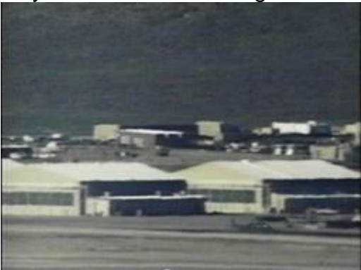
Area 51, NV (left) and White Sands Missile base, NM

The NSA, CIA, FEMA, Naval Intelligence, the Air force NORAD and others all need their own secret underground bases. Some of the work with strategic reserves, nuclear activities, secret weapons, communications and computers, and hardened defense structures are legitimate activities for underground bases; and others, genetic manipulation (like cloning), individual mind control, population control, and lethal ways to kill populations, are not. We have truly lost control over our government. If you'll pardon the pun, it is truly out of oversight.