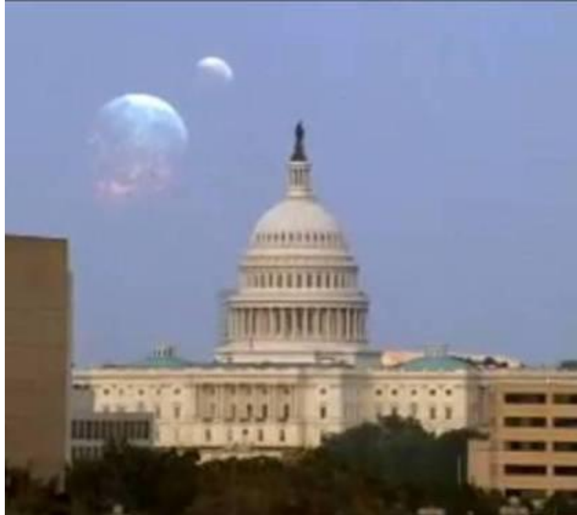
Extraterrestrial Home World appears between Earth and Moon in final episode of The Event

The Event is a fictional NBC television show featuring a black U.S. President grappling with the national security problem of whether or not to tell the U.S. public about the existence of extraterrestrial life. Comet Elenin is approaching the inner solar system and has been associated with major earthquake activity on Earth. What is the relationship between Comet Elenin and the Event? Perhaps nothing; or, maybe, a very lot indeed. For there is an important paradox surrounding Comet Elenin. The solution to the paradox may well have been revealed in the season finale of the Event. Were elements