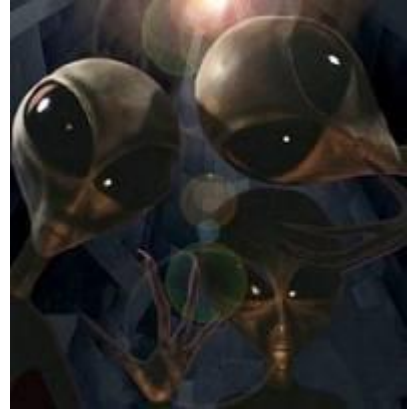
What is alien abduction?

In this generation, there is a phenomenon that has been chronicled by academics and dramatists alike. It is well known throughout all levels of society. At first, it was viewed as a myth; now it carries the veracity and weight of any other commonly-reported social phenomenon. In documentary fashion, motion picture theaters and television productions have presented it many times. But, of surpassing interest is its spiritual dimension. It spans the fullness of all questions surrounding God's creation, His sovereignty and the mysteries inherent in the dark forces who oppose Him. It brings Paul's statement about, "... principalities, powers and rulers of darkness in high places," into stark, glaring focus.