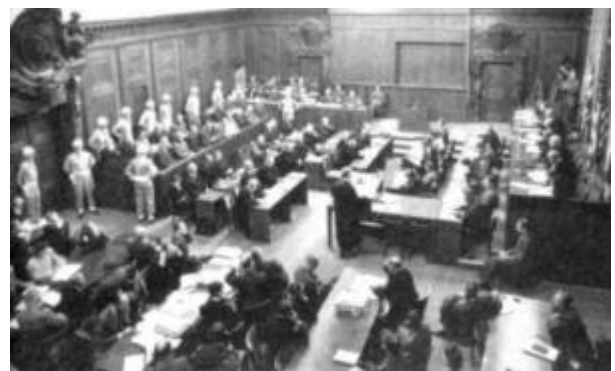
Nuremberg War Tribunal 1946/47: 24 managers of Hoechst, Bayer and BASF were indicted for mass murder, slavery and other crimes against humanity.

The result is well known: Helmut Kohl was chancellor of Germany for 16 years and the German pharmaceutical and chemical industry became the world's leading exporter of chemical products, with subsidiaries in over 150 countries, more than IG Farben ever had. Several billion people will now die prematurely, if the pharmaceutical industry gets its way. Germany is the only country in the entire world in which a former paid lobbyist for the chemical and pharmaceutical cartel was head of the government. To sum up, the support of German politics for the global expansion plans of the German pharmaceutical and chemical companies has a 100-year-old tradition.