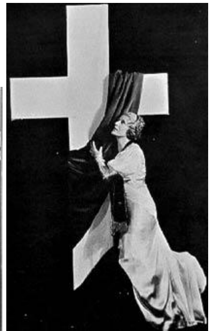
Aimee Semple McPherson

Ascended Lady Master Magda/ Aimee Semple McPherson