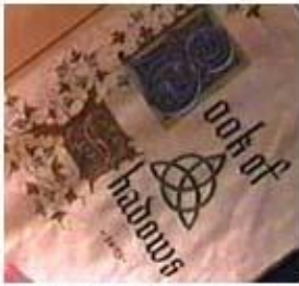
from the "Charmed" TV series

One of the most occultic television shows ever aired is "Charmed". "Charmed" details the spells and occultic practices of three witches. The "NKJV symbol" is the show's primary symbol of witchcraft and is splattered throughout the series. Notice the "NKJV symbol" displayed on "The Book of Shadows". The Book of Shadows is commonly used in withcraft and satanism: