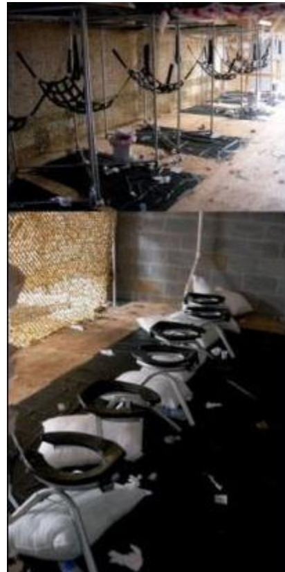
Images of devices to be made available at a Washington party for homosexuals

The requirements, AFTAH said, included, "Masculine, friendly, and ready to play. Spectators who wanna run their mouths and socialize are not welcome at this event. We are here to enjoy the company of MEN."