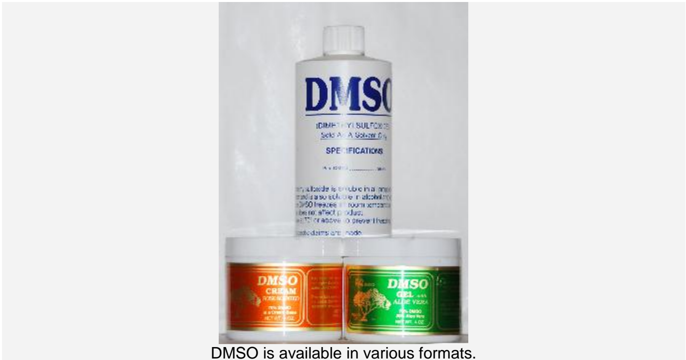
DMSO is available in various formats.

Sulfur has a long history of use as an antidote for acute exposure to radioactive material. Antioxidants have the capacity to reduce toxic effects of radiation in our bodies. Early research identified sulfur-containing antioxidants as among those with the most beneficial therapeutic effects.