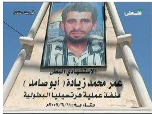
[Picture of suicide terrorist and Arafat on monument in town square in West Bank town Madama. [PA TV, May 15, 2010]