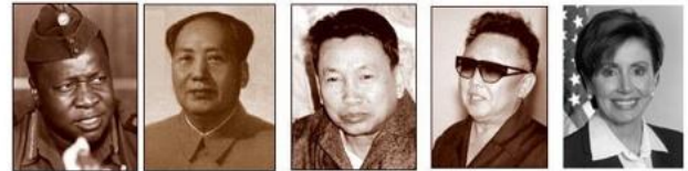
Idi Amin Mao Tse-tung Pol Pot Kim Jong-Il Pelosi