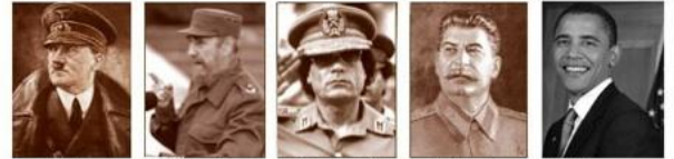
Hitler Castro Qaddafi Stalin Obama