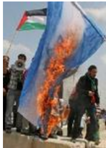
Gazans burn Israeli flag

DEBKAFfile Exclusive Report May 19, 2011,