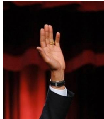
And what does

the Inscription on the Ring Obama will never take off mean?