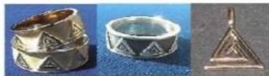
(U) BLogo jewelry