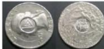
(U) BLogo imprinted on coins

These images were discovered by undercover volunteers on a website created by online sexual predators, where they instruct young girls and children that sex with older men is natural and their parents are lying to them and cannot be trusted because they are possessive and don't want their children to feel good.