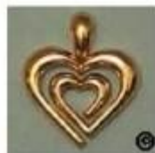
(U) GLogo Pendant