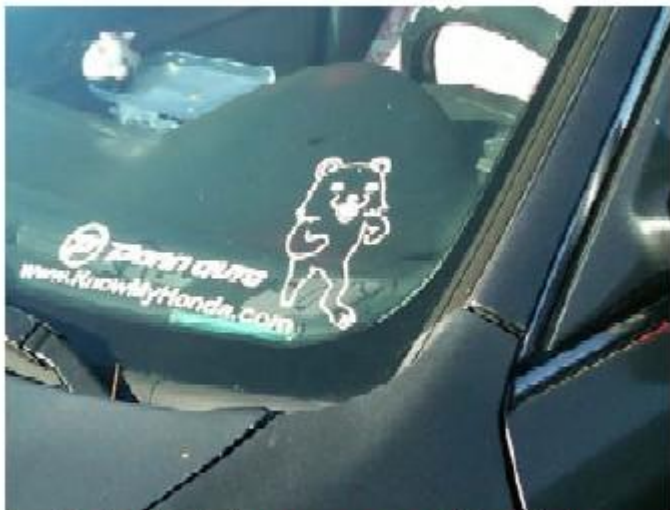
PedoBear's image on a vehicle window.

Be aware of your community events and the elements who might be lurking at them.