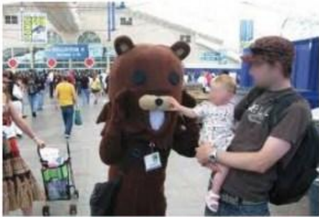
PedoBear posed for photos with attendees at San Diego's ComicCon