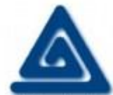
(U) BLogo aka "Boy Lover"