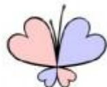
(U) CLogo a.k.a. "Child Lover"