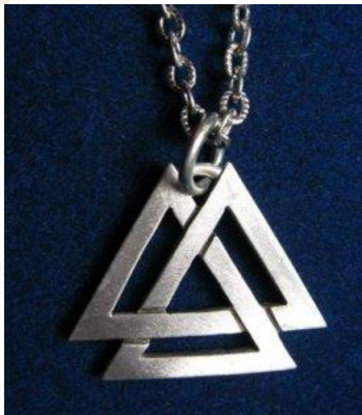
Jane Seymore's Wiccan Triple knot Roxy Surfer Girl Valknot necklace

Alice Day is a celebration by pedophiles and child rapists, who have distorted the relationship between Alice Liddell and Charles Dodgson – author of Alice's Adventures in Wonderland (though you know him by his pen name of Lewis Carroll). They claim there was a sexual