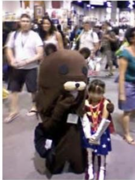
PedoBear posing with a young ComicCon attendee.