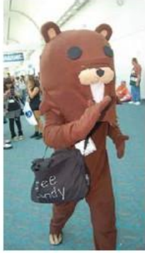
"PedoBear" as the original Internet meme on left, and the incarnation of "PedoBear" handing out Free Candy at San Diego's Comic Con.