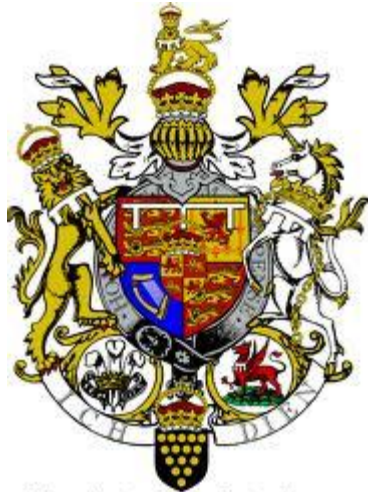
Prince Charles Philip Arthur George Born November 14, 1948 Father: Duke of Edinburgh Philip Mountbatten Mother: Queen Elizabeth