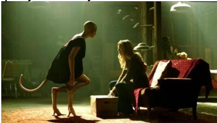
Scene from the movie “Splice”

human, half ape super soldiers, paving the way for a real life Planet of the Apes showdown.” Among the scores of research papers, DARPA budget line items, suspect locations where human-animal experimentation ethics may have passed the curtain of acceptability, and media reports forwarded to the producers was a Reuters news article dated November 9, 2009, titled “Scientists Want Debate on Animals with Human Genes,” which hinted at just how far scientists have come and how far they intend to go with human and animal hybridization. The news piece started out, “A mouse that can speak? A monkey with Down’s Syndrome? Dogs with human hands or feet? British scientists want to know if such experiments are acceptable,” [ii] then continued with revelations that scientists inside Britain were comfortable now with up to 50/50 animal-human integration. The article implied that not all the research currently under design is kept at the embryonic level, and that fully mature monstrosities (like the creature in the 2010 movie Splice ) are quietly under study.