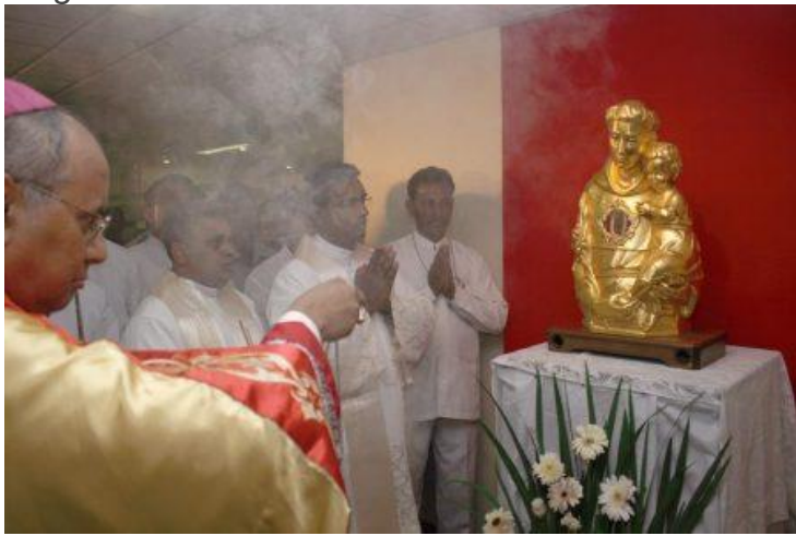
Catholic priest's burn incense in front of the gold idol, the tongue is placed where people normally would find the heart.