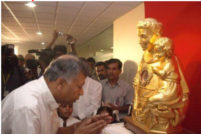
A Roman Catholic priest bows down and pray in front of the image of Gold.

What is the Bible saying about men who do this kind of things: