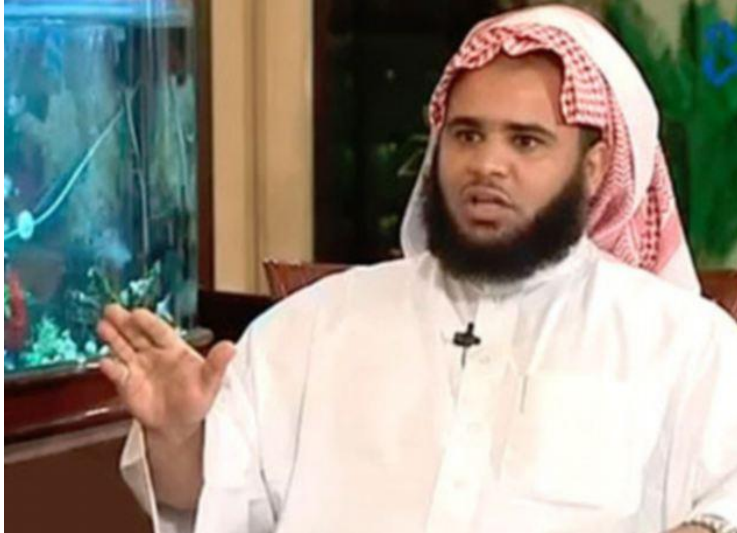
Saudi preacher Fayhan Ghamdi

Rather than the death penalty or a long prison sentence, the judge in this case ruled the prosecution could only seek 'blood money' , according to activists. The money is compensation for the next of kin under Islamic law.