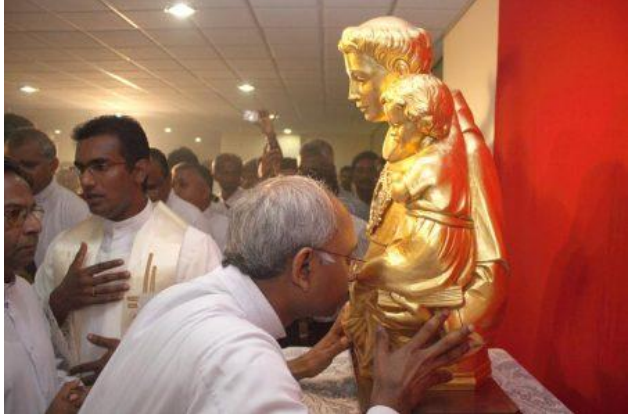
A Vatican appointed priest kisses the image of gold, that is supposed to have a holy tongue in a framed in its center.