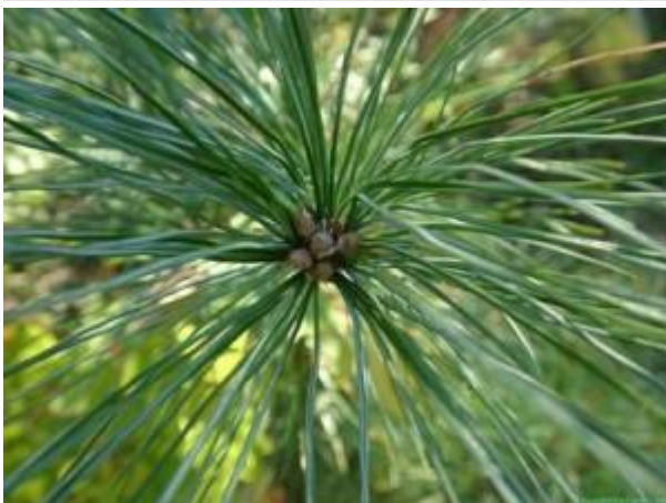
White Pine Needles For the Immune System

This website will be gone after April 30 th .