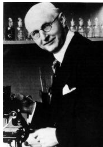
Dr. Weston Price

Fluoride, in particular, pulls calcium and phosphorus into areas of the body that they would not normally travel, such as the pineal gland and the arteries, so these minerals