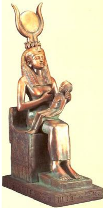
A depiction of the Egyptian goddess Isis and her son Horus

"Guided meditation is where the audience closes their eyes and you take them on a little journey," she explained. "I've taken people to their past lives in Egypt, as [that culture] had all the secrets. They're the ones that knew. Their main concept is to know thyself, know thy heart, know thy soul and know thy purpose."