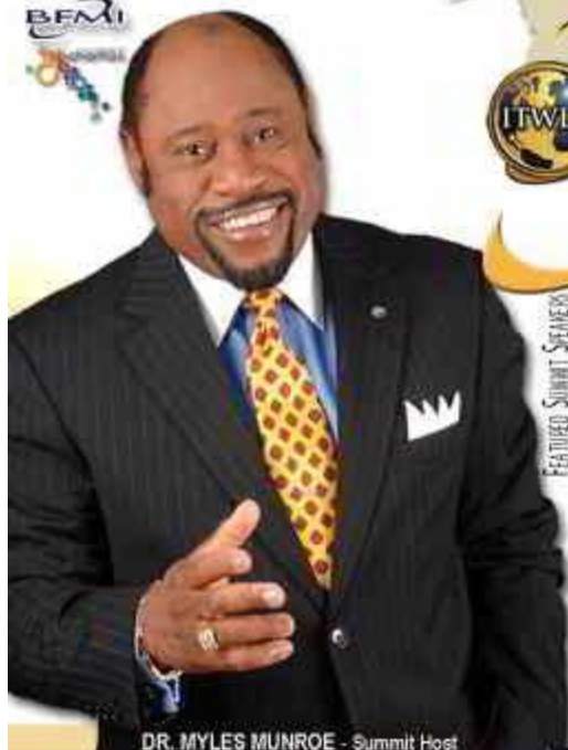
DR. MYLES MUNROE - Summit Host