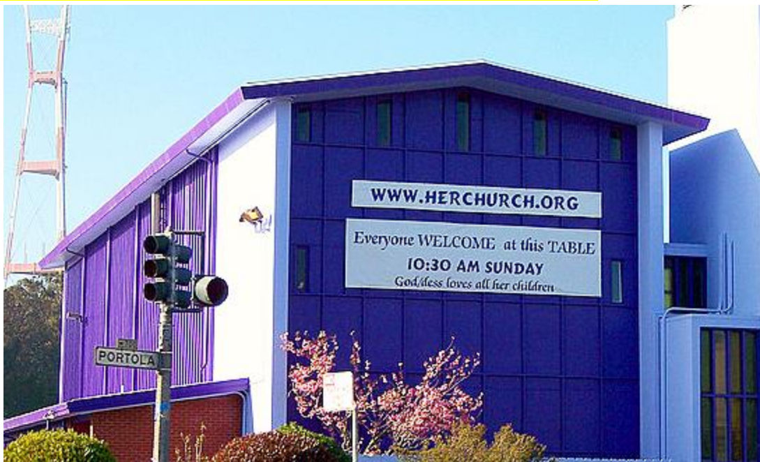
The Ebenezer Lutheran Church in San Francisco calls itself "herchurch."

"Our Christian/Lutheran feminist prayers and liturgy reach back into the storehouse of tradition to bring forth names as Mother, Shaddai, Sophia, Womb, Midwife, Shekinah , She Who Is. They do so out of renewed insights into the nature of the Gospel empowered by the risen Christ-Sophia."