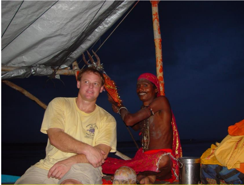
Cannibal Hunting in India.

Some of the savages from distant lands will eat children.