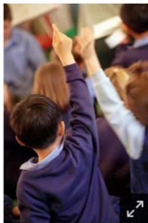
Modelling predicts a 50 per cent increase in the number of students with disabilities in NSW schools. QUENTIN JONES

The confidential report, obtained under freedom of information laws