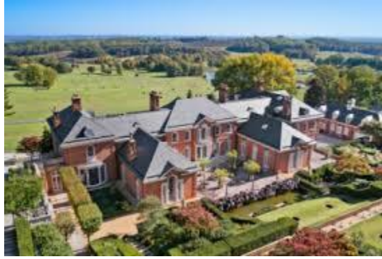
Albemarle Estate at Trump Winery