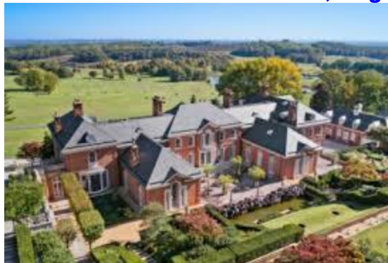
Albemarle Estate at Trump Winery

Donald Trump has paid about $30 million to settle child-sex complaints, including a 2012 incident at Albemarle Estate in Charlottesville, Virginia