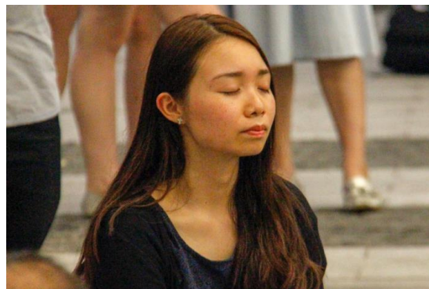
Photo: Religious demonstrators are still singing outside the legislative council building in Hong Kong.

But Christian demonstrators have had a constant presence, which some other demonstrators likened to protection.