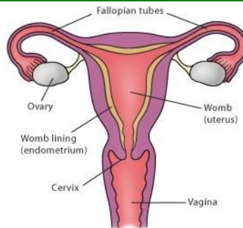
The Artemis logo is the female reproductive organs turned upside down