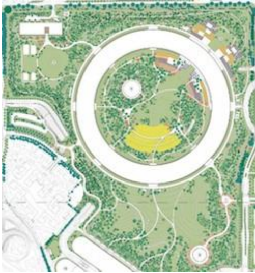
Apple's Cupertino headquarters layout (click here to enlarge)