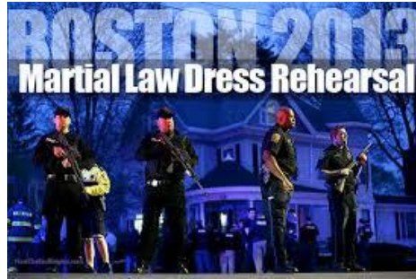
<<Boston's brush with Martial Law