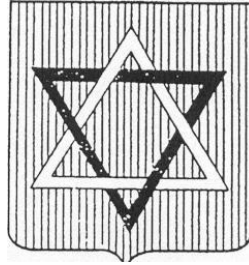
Present Use of the Six-Pointed Star

Coat of Arms of Rennes-le-Chateau (Merovingian castle) (Biagent, p. 396)