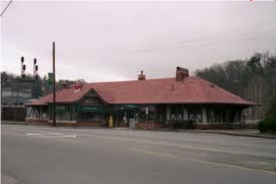
Old Train Station, Biltmore Village

In fact, my research has uncovered the reality of FEMA BOXCARS AND SHACKLES already in place in Asheville for the coming hour of martial law, as confirmed by several former Satanists involved in the preparation for martial law in that region.