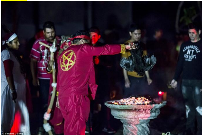
Torture: One witness said: 'They weren't just sacrificing these animals, but they were torturing them first'