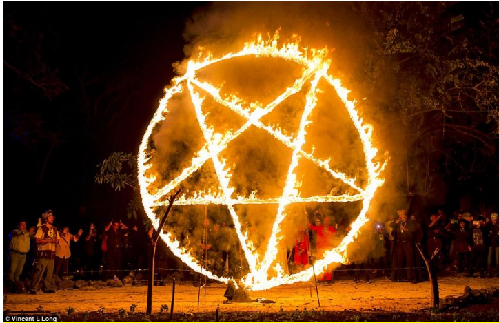
Participants dance before giant burning pentagrams before they pledge their souls to Satan