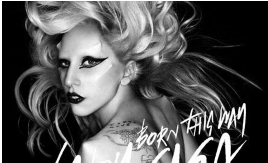
Lady Gaga's hyperactive skeleton on the cover of Born This Way

Lady Gaga grows horns and claims she's channeling Alexander McQueen guardian.co.uk , Thursday 14 April 2011—