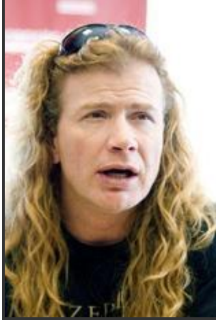
Mustaine: 'Black magic ruined my life'

The singer became fascinated in witchcraft as a teen and he's convinced spells he cast have come back to haunt him.