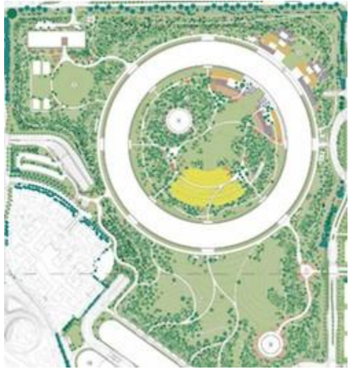
Apple's Cupertino headquarters layout (click here to enlarge)