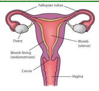
The Artemis logo is the female reproductive organs turned upside down