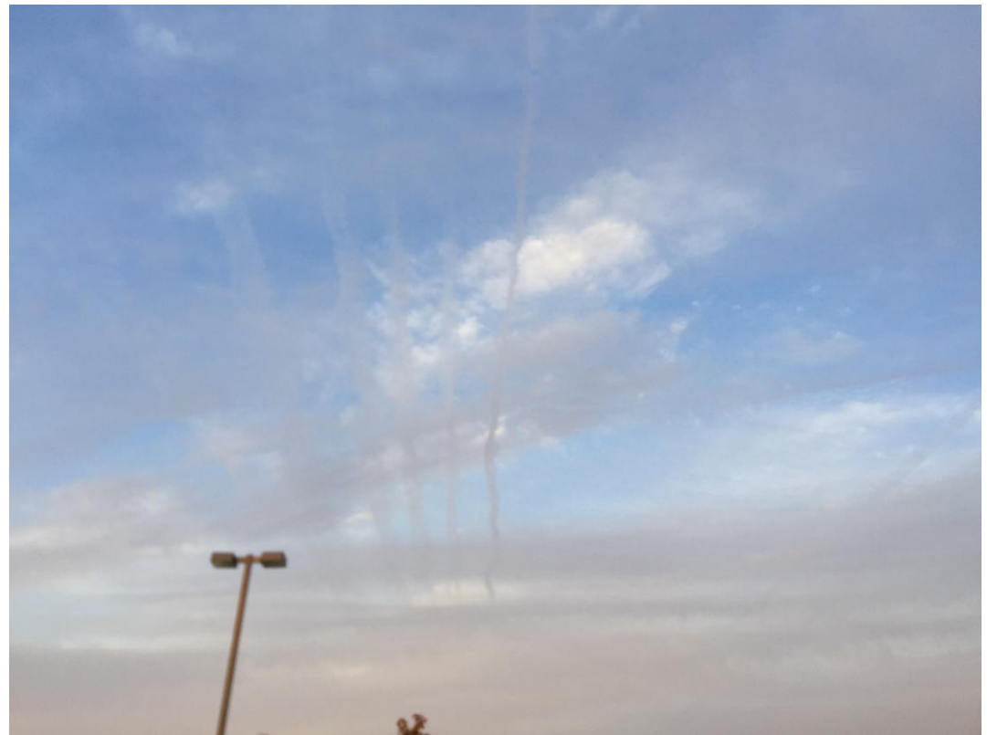
There was 6 Chemtrails side by side. The below photo was taken looking West.